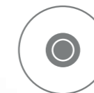
RELEASE LOCKING MECHANISM