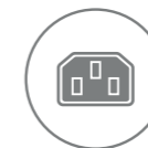
SUITABLE FOR USE WITH ANY C14