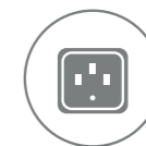
C13 LOCKABLE OUTLET