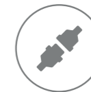
PREVENTS ACCIDENTAL DISCONNECTION